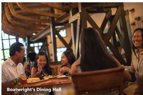
Boatwright's Dining Hall