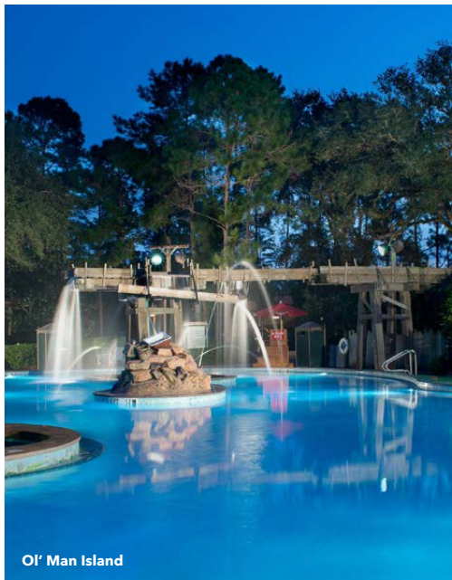
Ol' Man Island