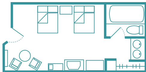
Typical Standard Room, Parking Areas & Landscaping View, with two queen beds, 314 sq. ft. Accommodates up to four Guests plus one child under age 3 in a crib.