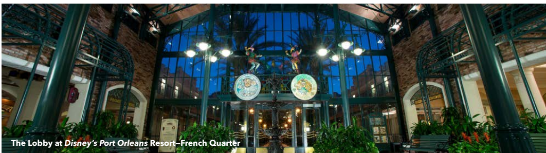
The Lobby at Disney's Port Orleans Resort—French Quarter