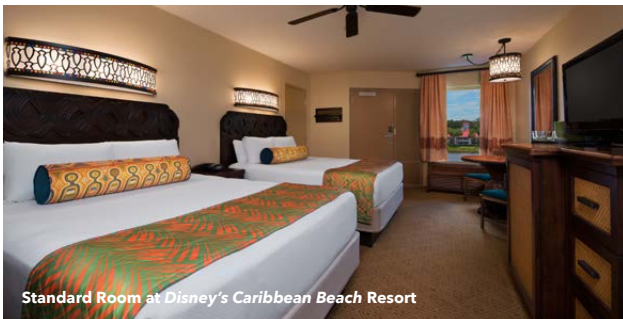
Standard Room at Disney's Caribbean Beach Resort

This Disney Moderate Resort celebrates the spirit of tropical locales—from the legacy of colonial forts and architecture to lively markets, exotic birds and relaxing strolls on the sand. Each island complex is bright, airy and colorful with access to a 45-acre lake and sandy beaches.