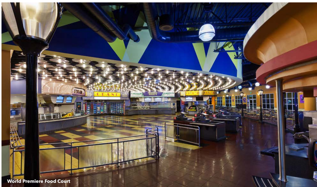
World Premiere Food Court