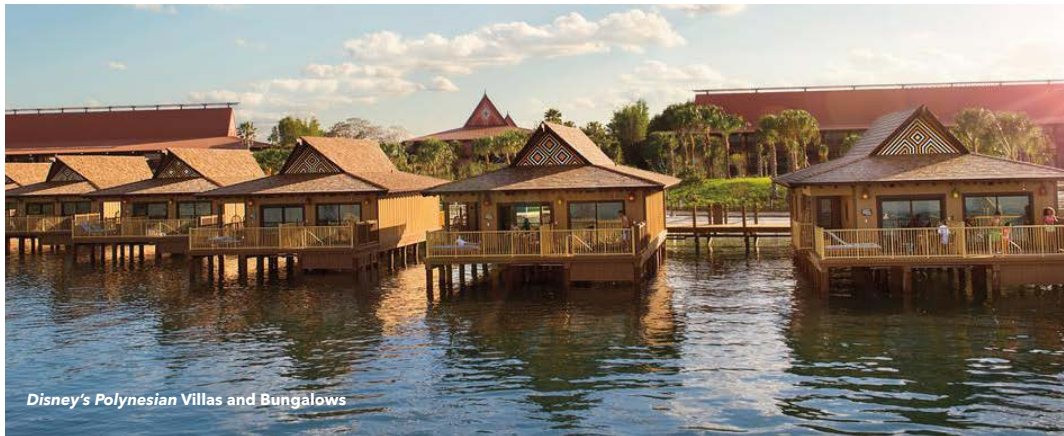
Disney's Polynesian Villas and Bungalows