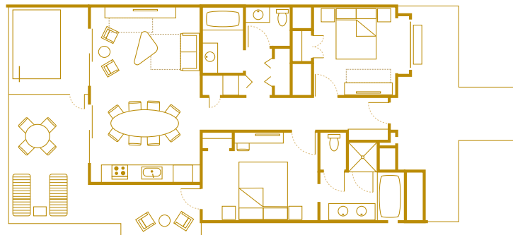
Bungalow , 1093 sq. ft. Accommodates up to eight Guests plus one child under age 3 in a crib.