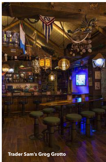
Trader Sam's Grog Grotto

Great Ceremonial House – Try a tropical drink at this tribute to the tiki god, featuring a full bar of libations and Hawaiian-inspired pupus.